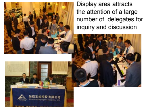
Display area attracts the attention of a large number of delegates for inquiry and discussion